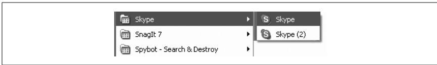
Figure 4-9. A newly created menu shortcut for Skype

Navigate to Skype on the Windows menu (select Start → All Programs → Skype), and right-click on the Skype icon. A pop-up menu should appear, from which you should choose Create Shortcut. This will create a shortcut under the Skype menu (see Figure 4-9 ).