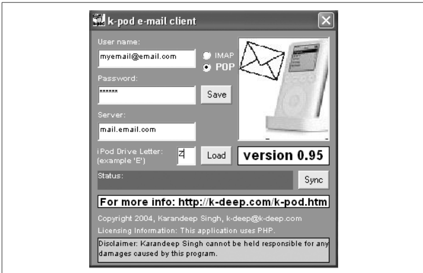
Figure 3-21. K-Pod's main interface window