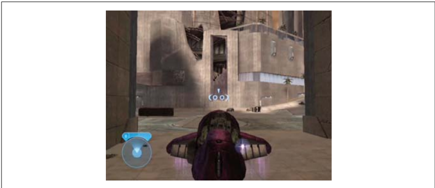
Figure 3-11. The soccer ball building

First, you will need to grab the Sputnik skull [Hack #16] . This will allow you to grenade jump considerably higher than normal. Next, make your way through Metropolis until you pass by a water fixture and reach the mission objective "Regroup with Marine forces in the city-center." This is just past the location of the Catch skull [Hack #10] . After the water fixture, you will come out into an open street and the soccer ball building will be straight in front of you (see Figure 3-11 ).