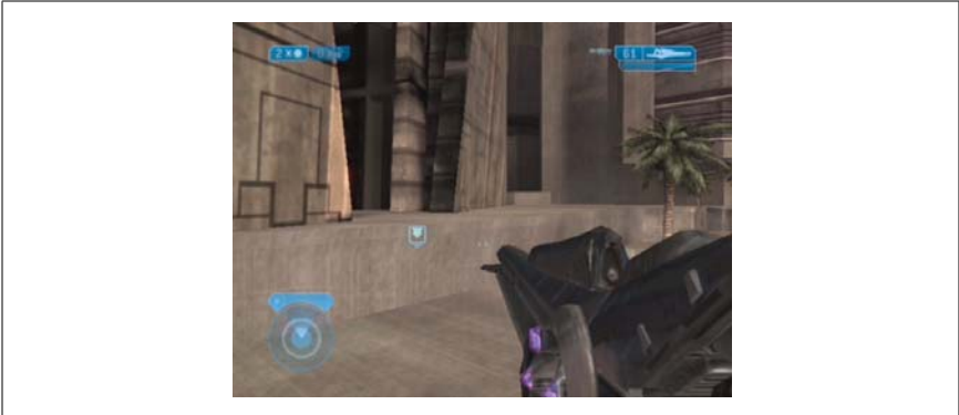
Figure 3-15. Straight ahead to the egg

The giant ball is hiding in a dark room just around the corner (see Figure 3-16).