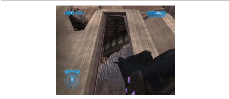
Figure 3-12. The landing zone for your grenade jump