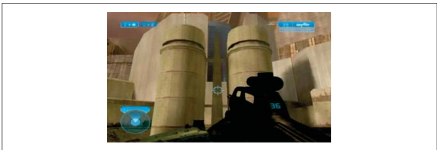
Figure 2-13. Lining up the grenade jump for the Catch skull

Once you have defeated the enemy, move around the left side of the room and then onto the center platform (see Figure 2-13). You will see a large semicircular beam going from the ground to the top of two matching towers. Do a grenade jump [Hack #2] at the bottom of this beam and walk all the way to the top.